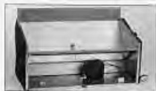
Commercial Room Ventilator