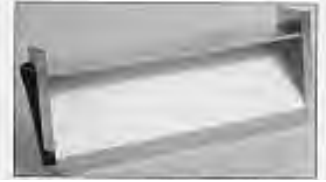
Barometric Fresh Air Damper

Bard Wall-Mounts are designed to provide optional ventilation packages to meet all of your ventilation and indoor air quality requirements. All units are equipped with a barometric fresh air damper as the standard ventilation package. All ventilation packages can be built-in at the factory or field-installed at a later date.