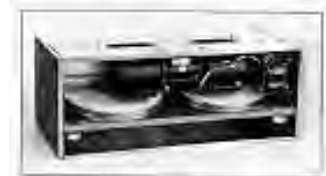
Energy Recovery Ventilator