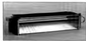
Motorized Fresh Air Damper